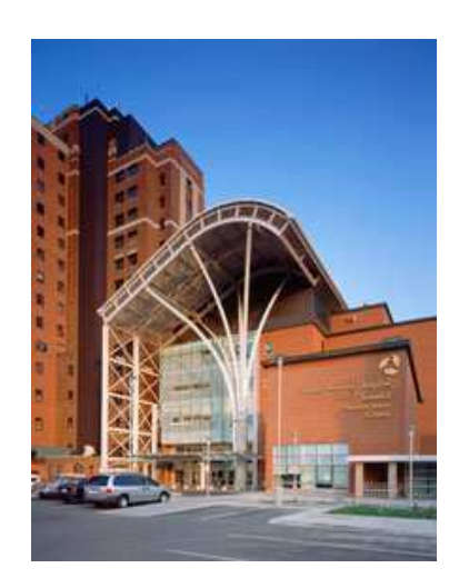
Toronto Western Hospital

In the spring of 2014, the Leadership and Mentoring Committee of the Psychologists in Hospitals Section of CPA conducted a survey to gather information about the role of Professional Practice Leaders/ Chiefs across Canada. Our goal was to glean a better understanding of how PPLs function in hospitals, provide the bases for forming benchmarks for PPL responsibilities, and identify areas where our profession may need to advocate for improvements. In total, we had 22 responses from PPLs across Canada: Alberta (2), Manitoba (1), New Brunswick (2), Nova Scotia (1), Quebec (5), and Ontario (10). About half of the respondents were from university affiliated teaching hospitals and 69% had CPA-accredited predoctoral internship/ residency programs. Respondents represented a broad spectrum of services for children and adults, health and mental health, tertiary care, and military. Most respondents were well seasoned in their positions, averaging 5 years (range < 1 year to 11 years). In total, respondents represented 348 doctoral (range 0 - 125; = 17) and 253 masters (range 0 - 150; = 12) prepared psychologists. On average, .5 FTE was allocated for PPC/PPL responsibilities, ranging from no specifically allocated time to full time. Most health centres had program or matrix types of